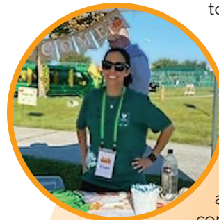
◀ The Viera Community Institute hosted Viera's Harvest Festival in October at Viera Regional Park. The community event was filled with traditional fall vendors, children's activities, and food trucks.