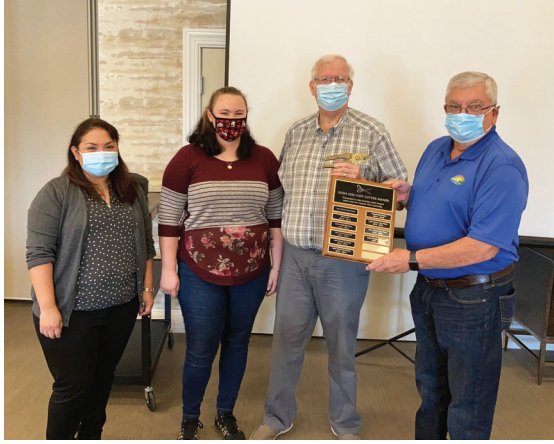
▲ The Lake Placid sod operation earned Duda Ranches' Cost Cutter award in the fall. The award honors the sod location with the lowest cost per square foot during the fiscal year.