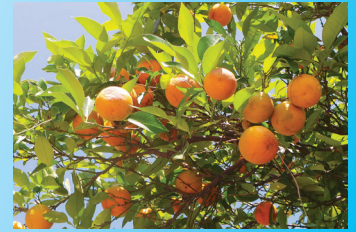
► Duda Ranches' LaBelle citrus operation was awarded silver in the Farm Sustainability Assessment, granted by the Sustainable Agriculture Initiative, in March. The FSA examines several topics, including nutrient, waste, and water management, chemical control, biodiversity, labor conditions, and more.

Employees in Belle Glade hosted the annual congressional staff tour where they showcased the Belle Glade operation and discussed various agricultural issues like domestic and H-2A labor, water supply, food and worker safety, grower challenges, technology in farming, worker housing, and research and development.